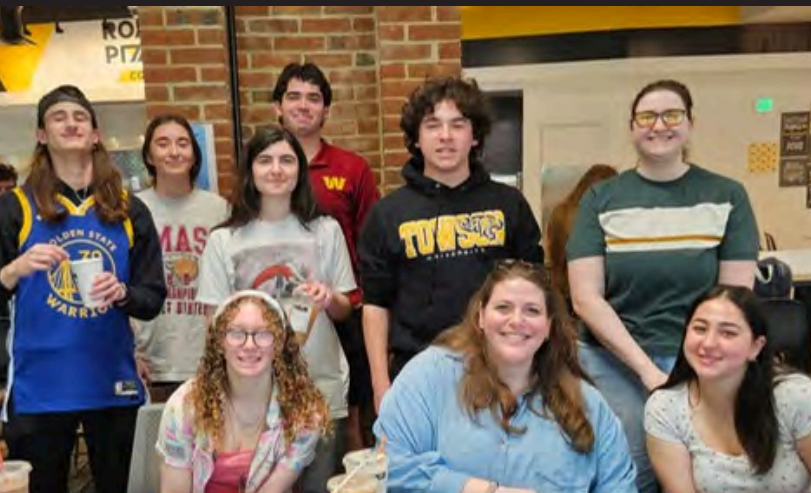
JAVA WITH JAMIE