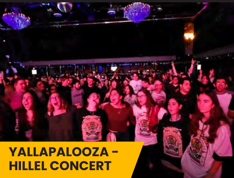
YALLAPALOOZA - HILLEL CONCERT