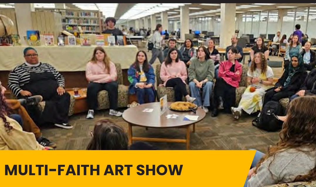
MULTI-FAITH ART SHOW