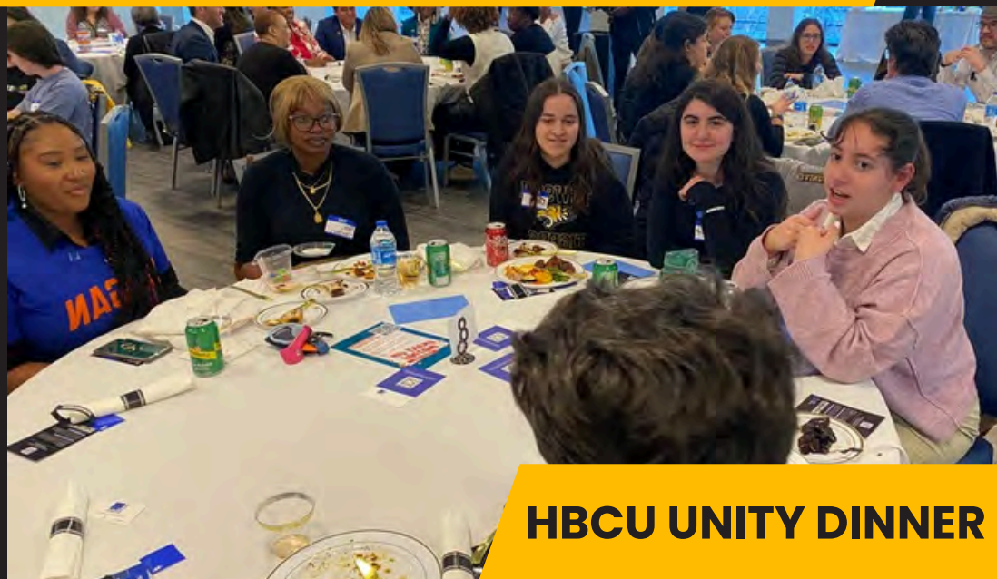
HBCU UNITY DINNER