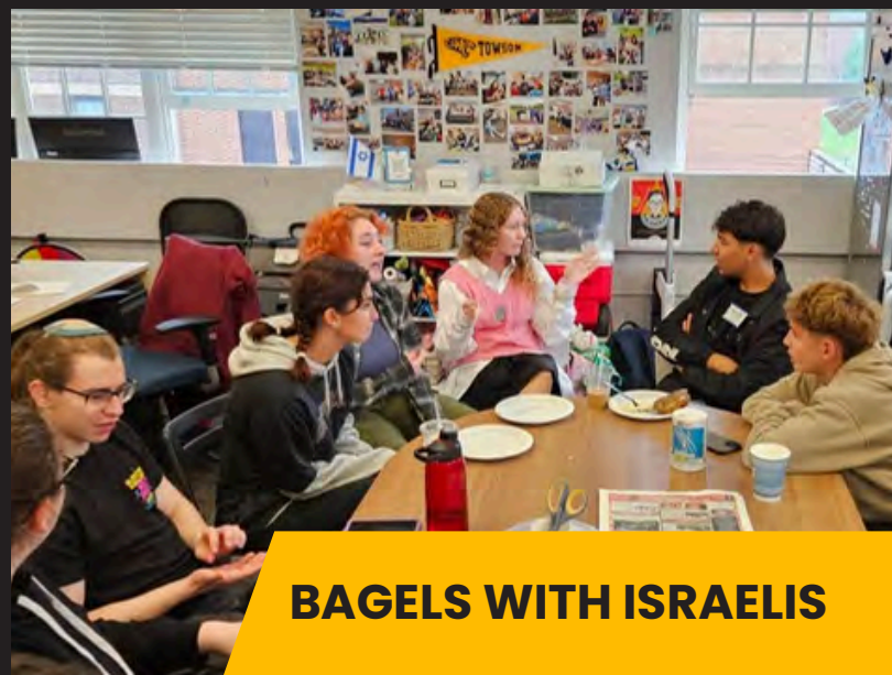
BAGELS WITH ISRAELIS