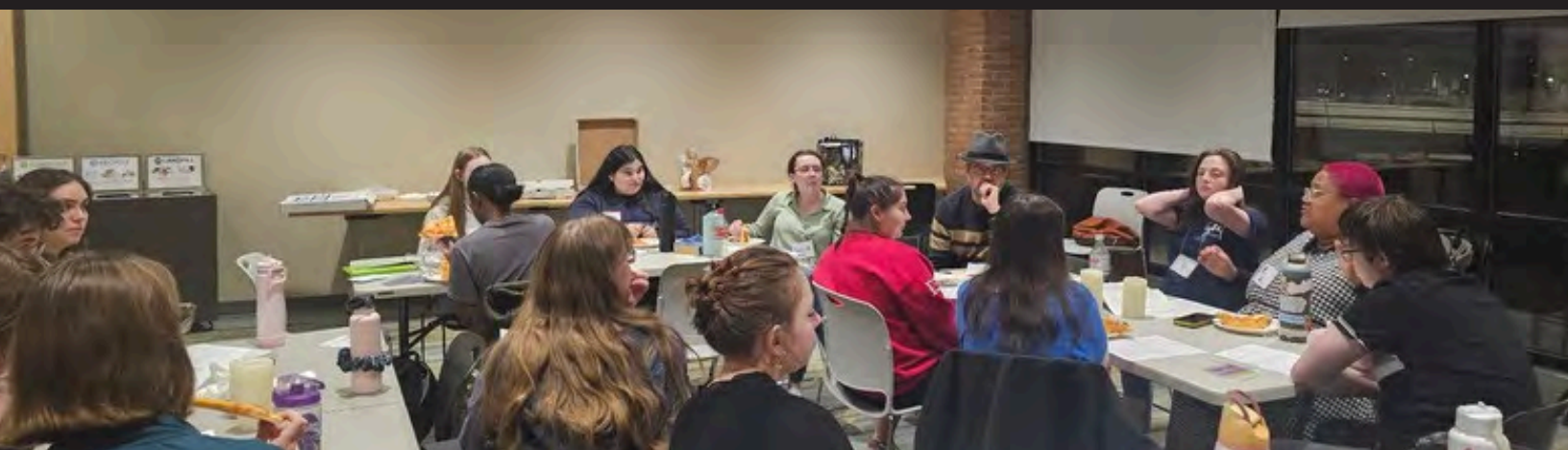
LEARNING WITH THE TABLE: LUTHERAN EPISCOPAL MINISTRY