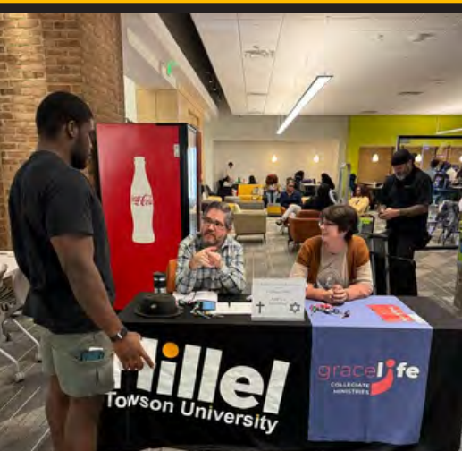
ASK ME ANYTHING