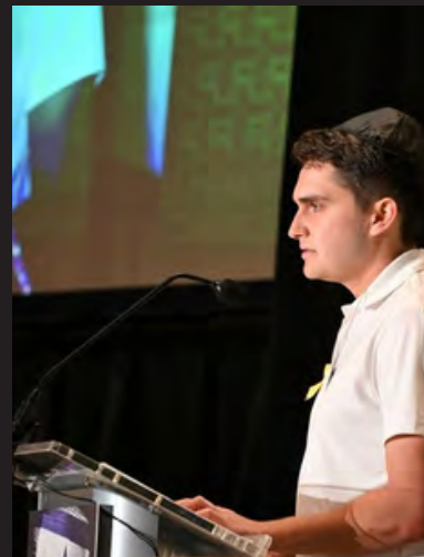
OCTOBER 7 TH MEMORIAL