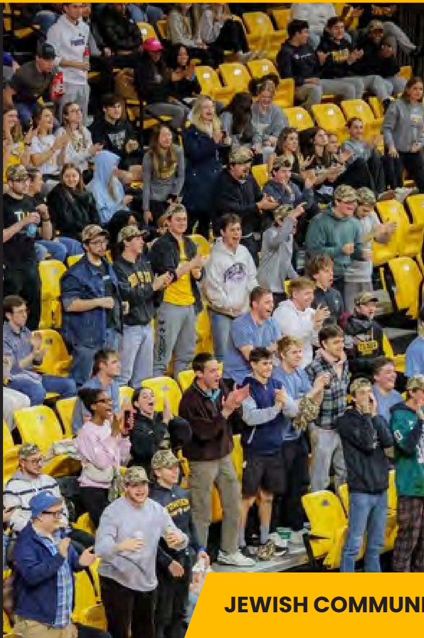
JEWISH COMMUNITY NIGHT